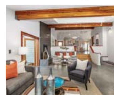
1096 Oak Hill Road, Lafayette 4+ Bed | 3 Bath | 3,545 Sq Ft | 0.86 Acre $1,795,000 1096OakHillRoad.com

Lisa Brydon & Kristi Ives 925.788.8345 bi@brydonivesteam.com DRE 01408025 | DRE 01367466