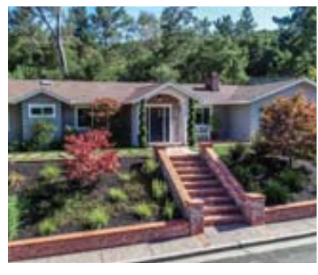
236 Scofield Drive, Moraga 4 Bed | 3 Bath | 2,610 Sq Ft | 0.26 Acre $1,695,000