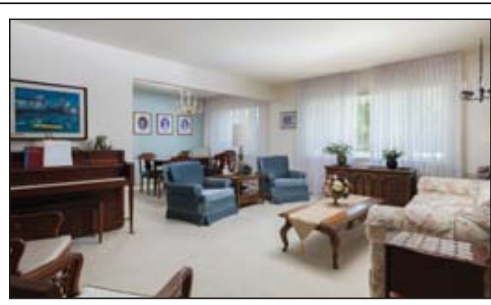
15 Fieldbrook Place | List Price $1,139,000 | Sold Price $1,276,000

As always, I am here to help... I listen and I care! I'm selling homes fast! Yours could be next! Call me for a no obligation visit!