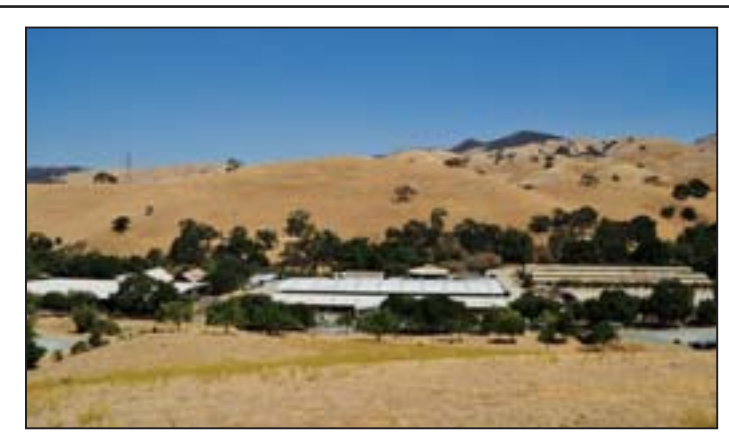
1550 Castle Rock | List Price $4,950,000 | Sold Price $4,400,000

925.376.7777 keith.katzman@compass.com DRE # 00875484